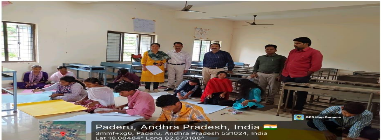
Paderu, Andhra Pradesh, India 3mmf+xc6, Paderu, Andhra Pradesh 531024, India Lat 18.08484° Long 82.673188°